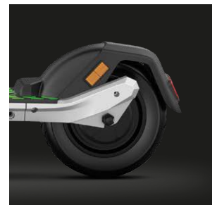
350W motor, Peak Power: 550W