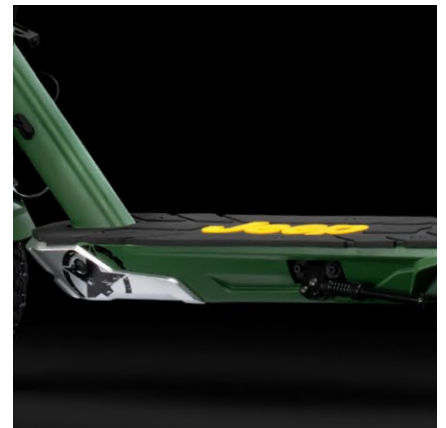
Up to 40km of range, 374Wh battery