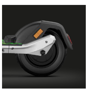
350W motor, Peak Power: 550W