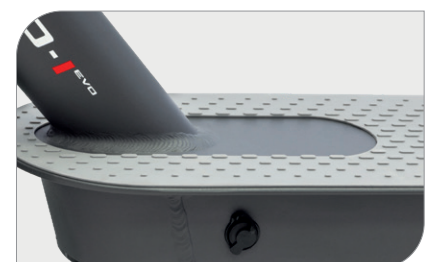
Battery of 280 Wh, up to 25 km of autonomy