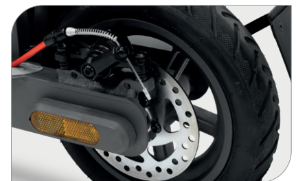
Brake system with integrated KERS technology