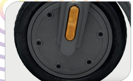
Brushless motor 350 W, 15 Nm