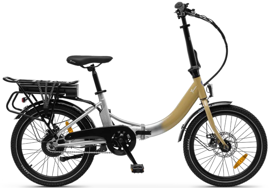
Bike carry bag included