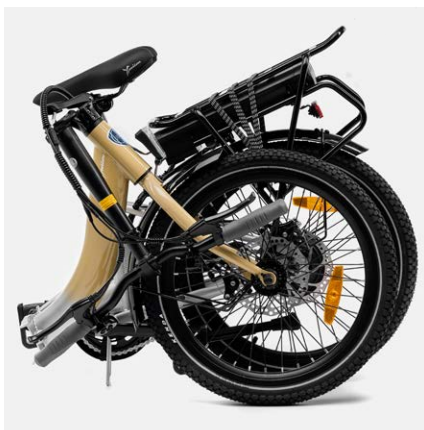
Foldable and compact