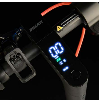
Integrated color LED display