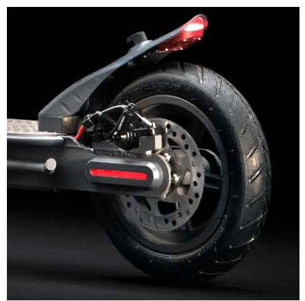
Rear disc brake