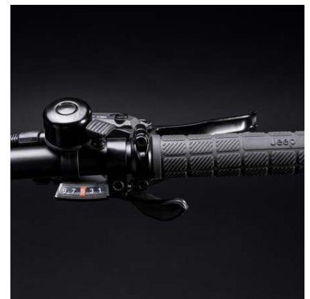
9 speed shifter