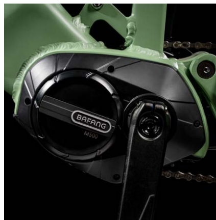
Bafang central motor