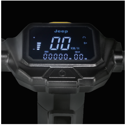
3.5" LED display