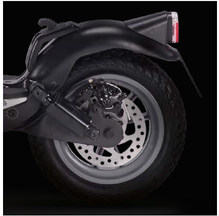
Rear disc brake