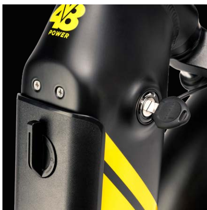
Up to 80km of range