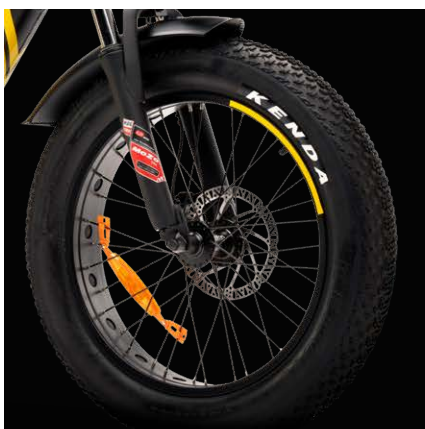
20" FAT tyres