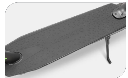
259 Wh battery: up to 28 km range