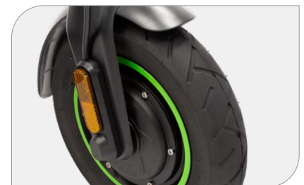
10" Inner-tube tyres