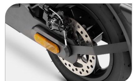
Braking system with integrated KERS